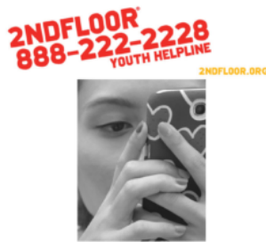
2NDFLOOR NJ's Youth Helpline