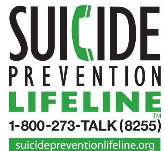
National Suicide Prevention Hotline